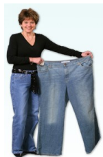
Do you have questions about our programs? Call 770-531-2433