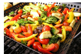
Fresh grilled non-starchy vegetables.