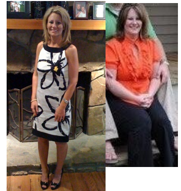
Weight Loss Success!

bypass to lower my blood pressure and hopefully avoid a second knee surgery, I did not expect is the amazing success that followed. In only 9 months, I have lost 106lbs and have reached my goal weight! I am currently taking no blood pressure medicine and my knee pain is non-existent, even my teenage children struggle at times to keep up with